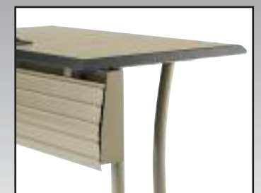
1680/1685 End closure cap