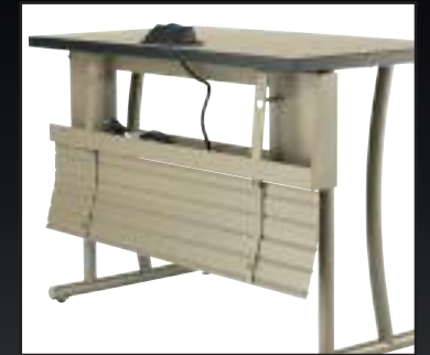
1685 Closed compartment with one hinged door and one bolt-on front door