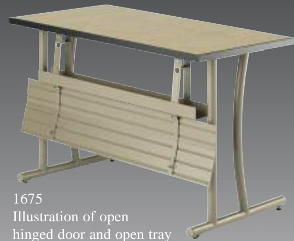
1675 Illustration of open hinged door and open tray