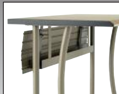
1675 Illustrations inside of door and open tray

1675/1680/1685 Series modular tables for training and seminar applications.