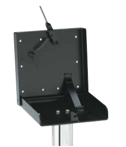
Flip Top Box with anti-tip safety bar.