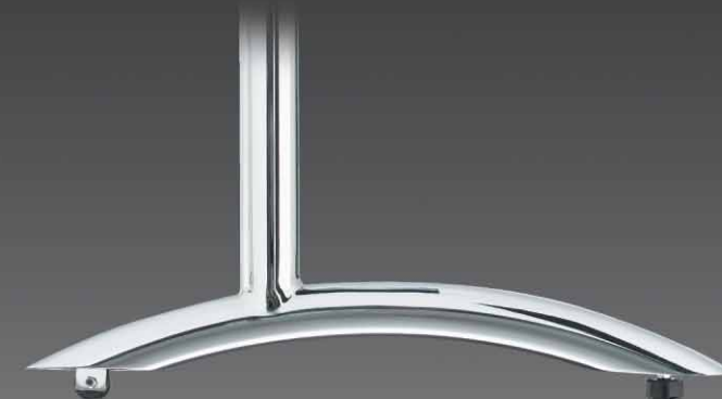
Base with Caster/Equalizer Glide Option