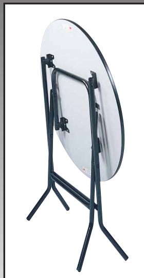
Table in folded position