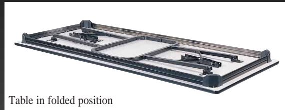
Table in folded position