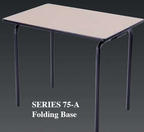
SERIES 75-A Folding Base