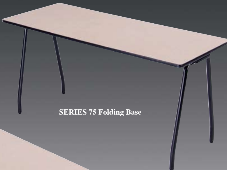
SERIES 75 Folding Base