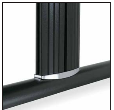
Illustration of 850 reveal