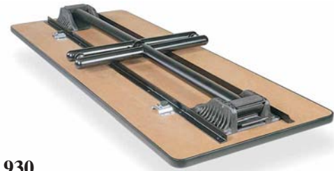
930 • 60" long table folded position