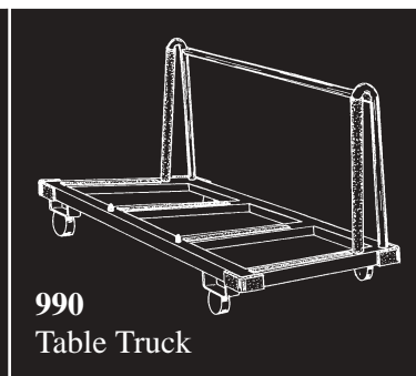
990 Table Truck