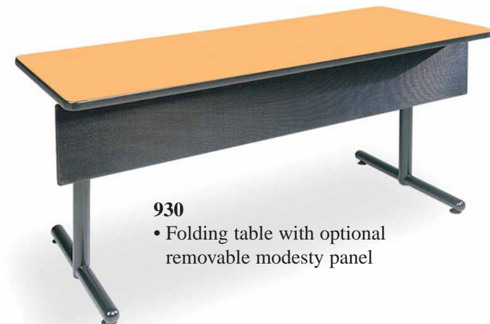
930 • Folding table with optional removable modesty panel