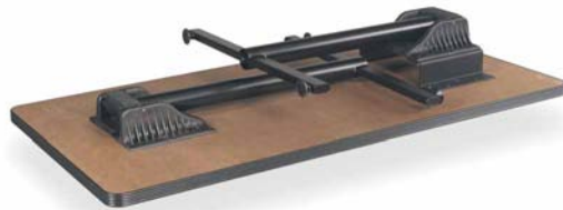
925 • 48" long table in folded position