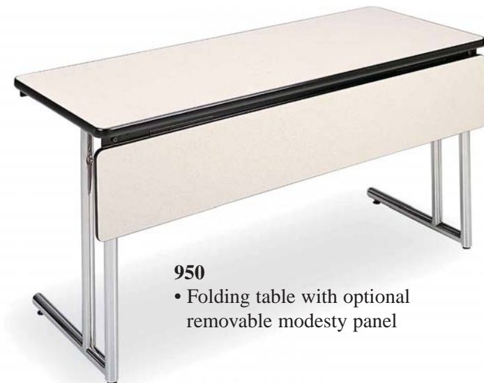
950 • Folding table with optional removable modesty panel