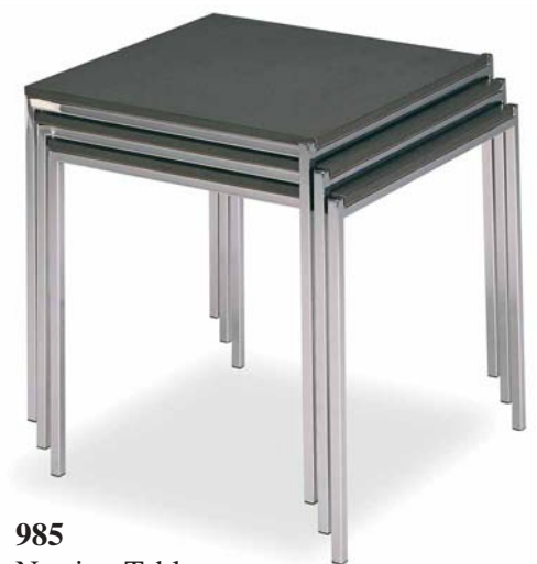
985 Nesting Tables • Nests eight high • Optional table truck